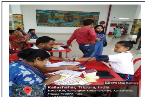
Celebration of Blood donors by NCC