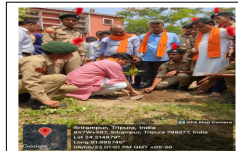
Celebration of world environment day