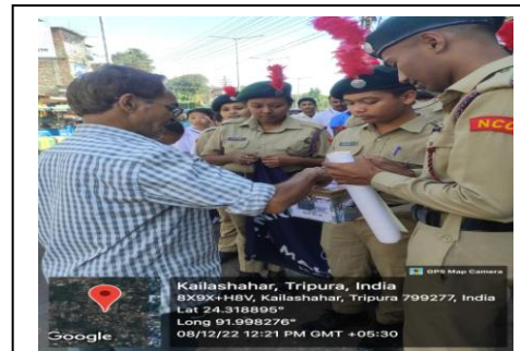
Armed force flag day.