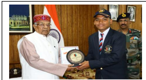
Appreciation of participation of RDC