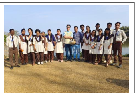
Field Trip. Dept. of Geography