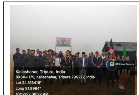
Vijay Divas, Bike rally, NCC